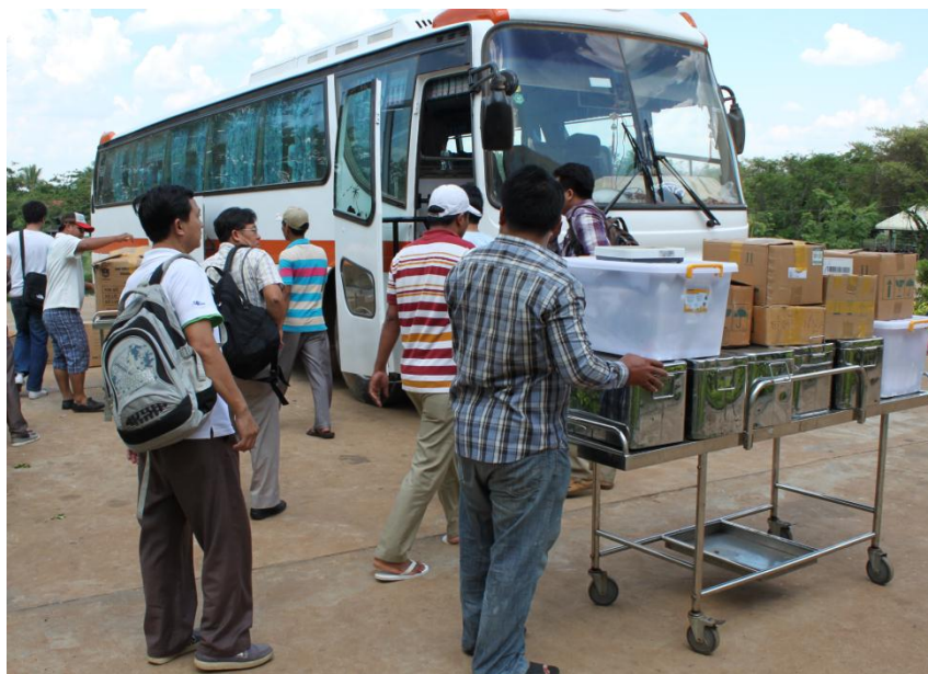
Fig 3: NPH surgical Team on its arrival at Preah Vihear Provincial Hospital