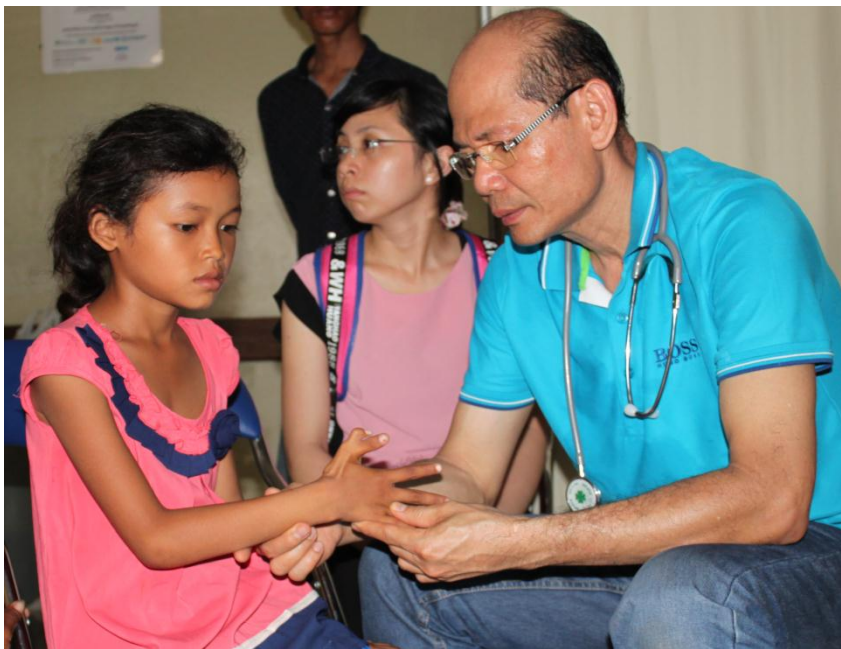
Fig 8: Patient consultation: June 11 2015