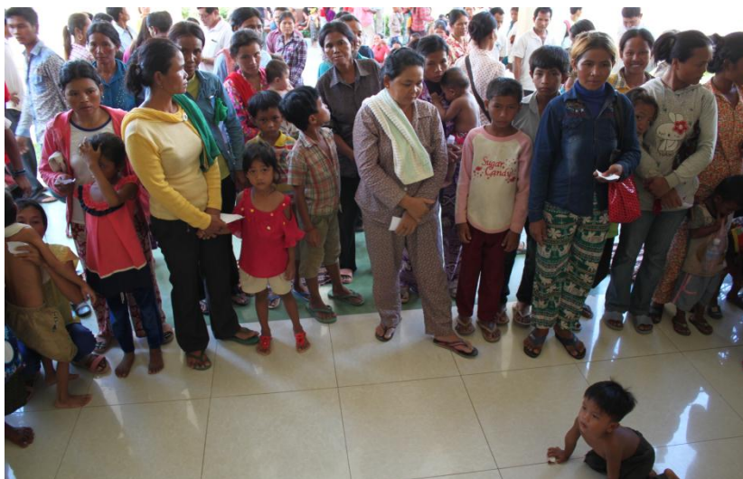
Fig 4: Waiting for consultation at mission site