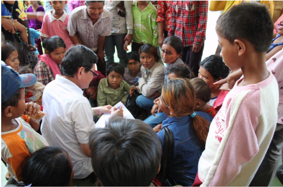
Fig 5: Patient triage