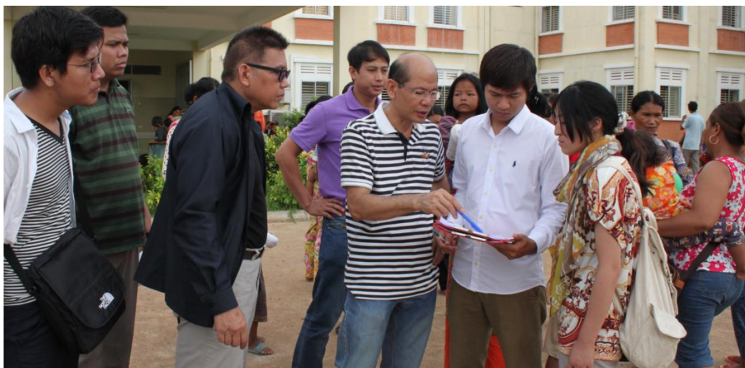
Fig 16: Hand over patient care and follow-up to local surgeon before departure