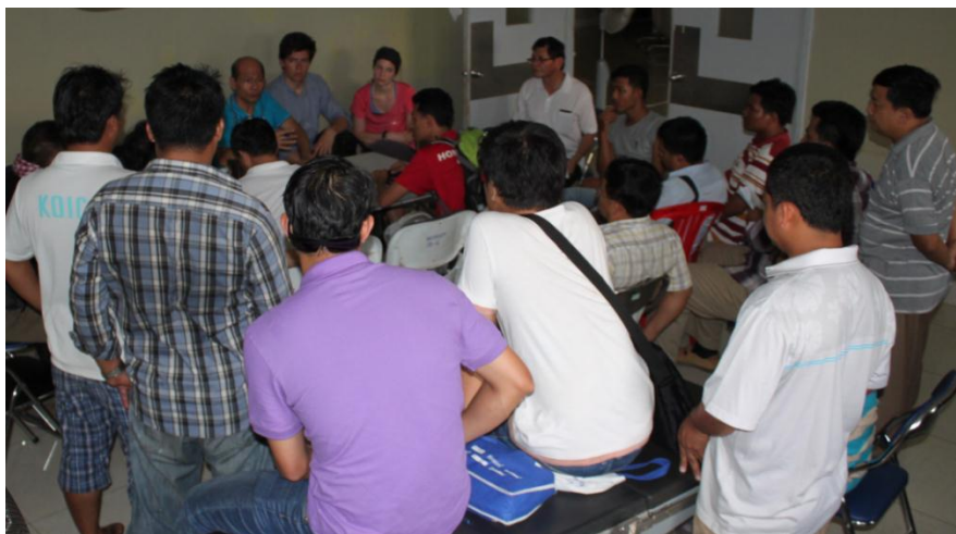
Fig 9: Team coordination Meeting