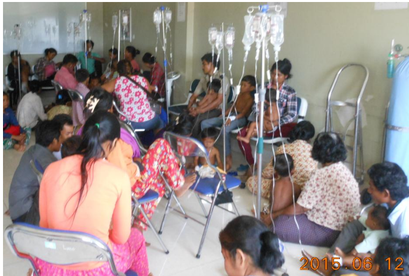
Fig 11: Pre-operative room- Waiting for surgery