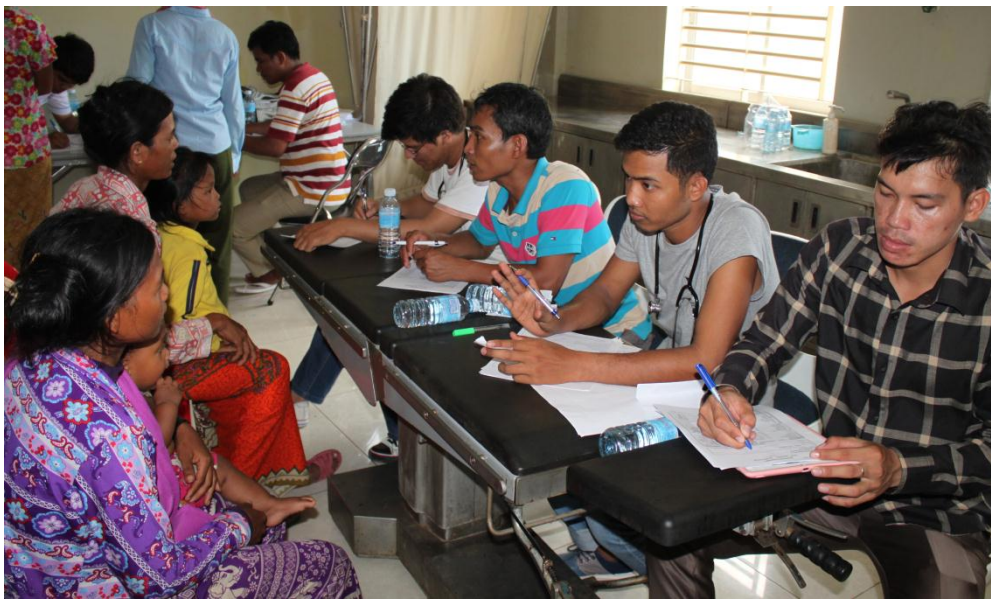
Fig 6: Anesthetic consultation on Day 1: 11 June 2015