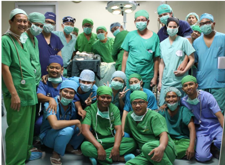
Fig 15: Missionary Surgical Team