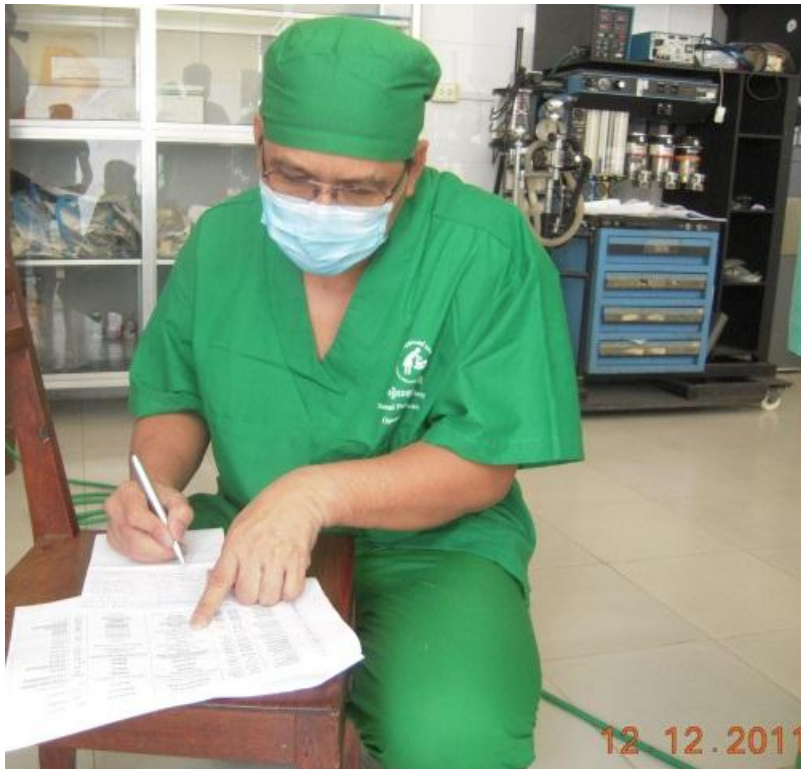
Recording Surgical Procedure – During Surgery