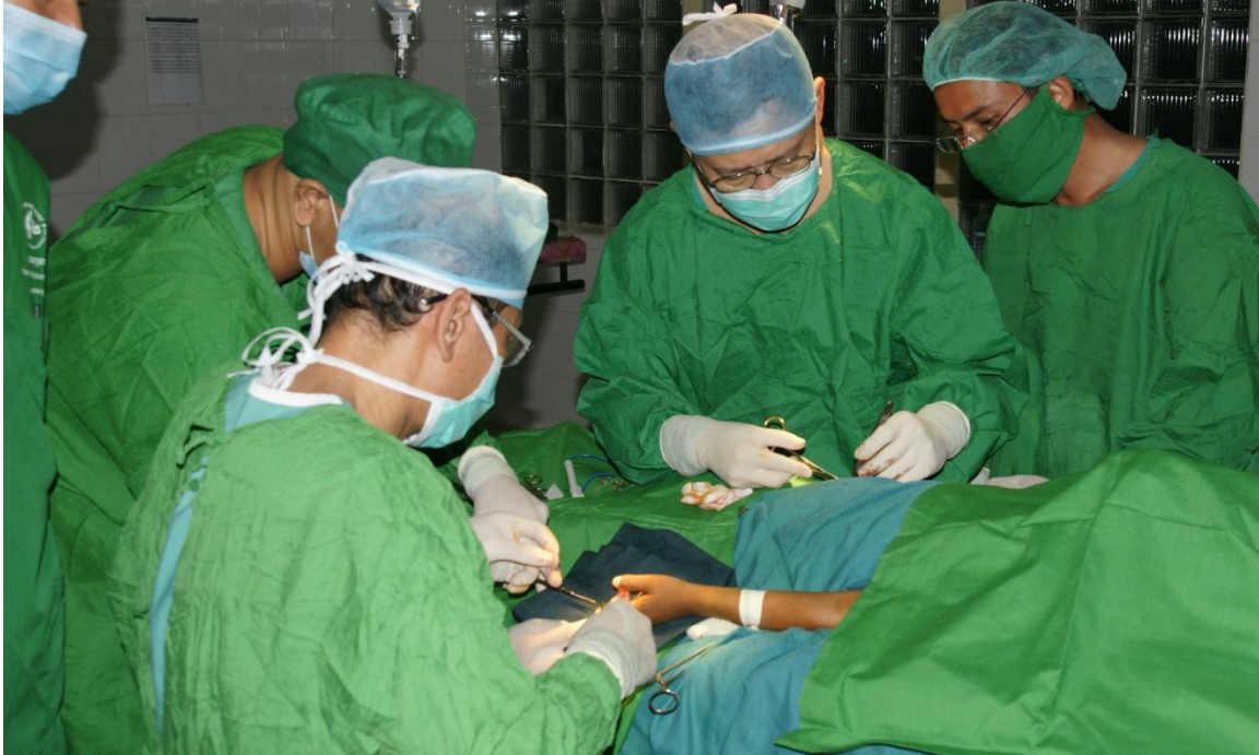
Reconstructive Surgery for Syndactyly