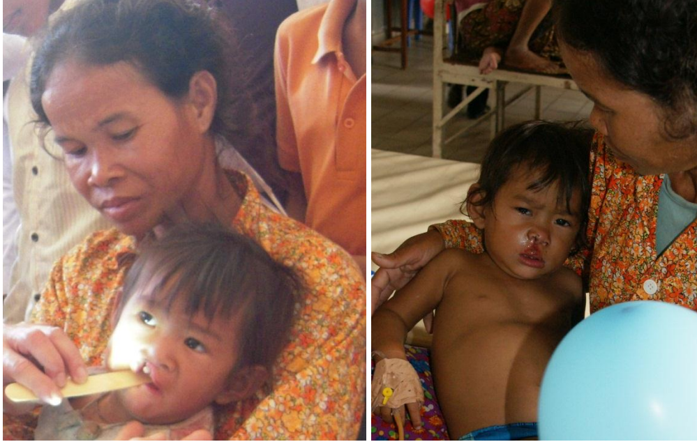
Unilateral Cleft Lip of 3 year-old girl Before and After Lip Repair Surgery