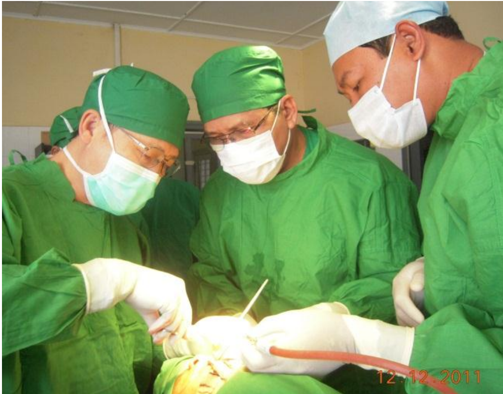
Surgical Procedure: – Cleft Surgery