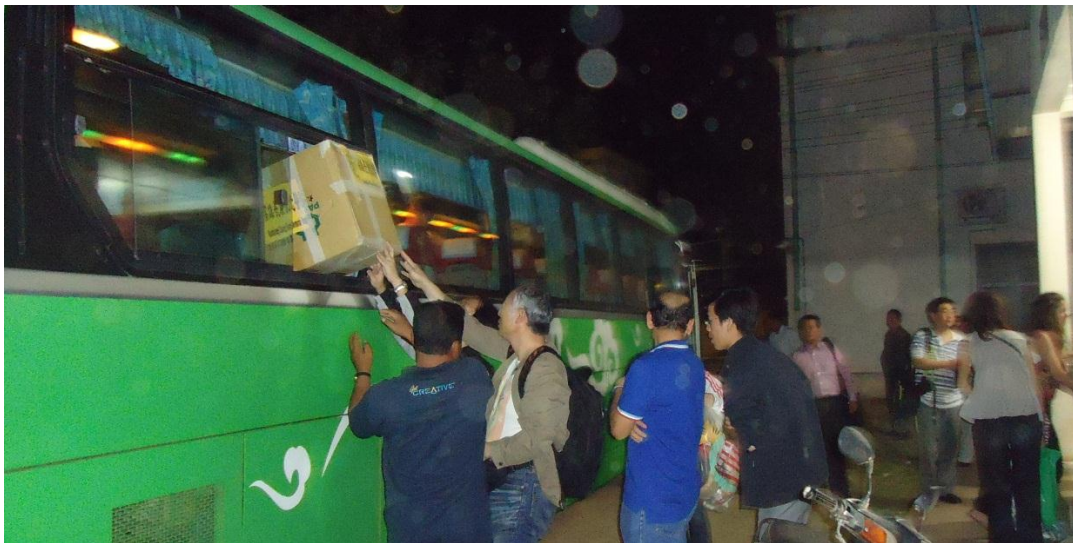
Moving Stuff back into the Bus at the end of the Mission