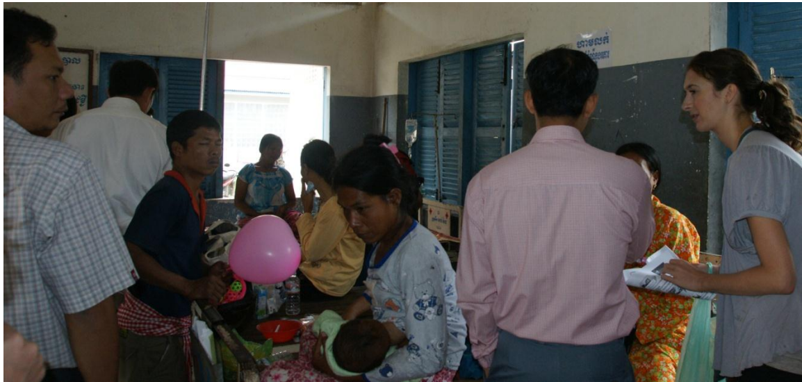
Ward Round with Speech Pathologist