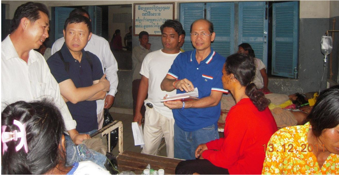
Ward Round at 8:30 pm after Surgical Operations of the Second Day-Mission