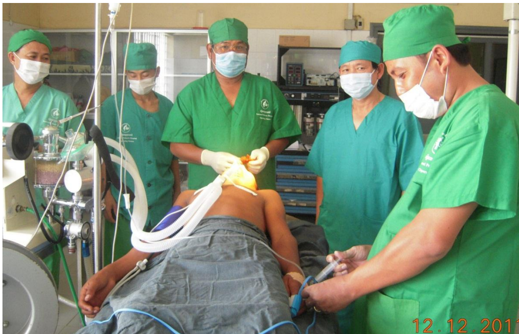
Anesthetizing patient – Prior to Surgery