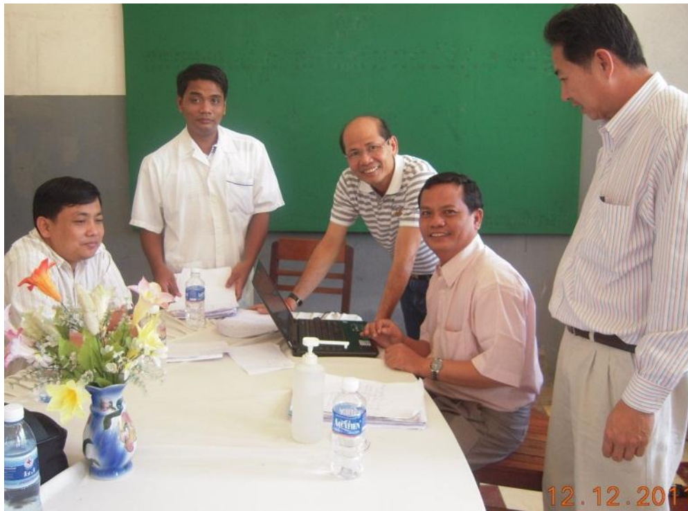
Preoperation Recording – Before Surgery