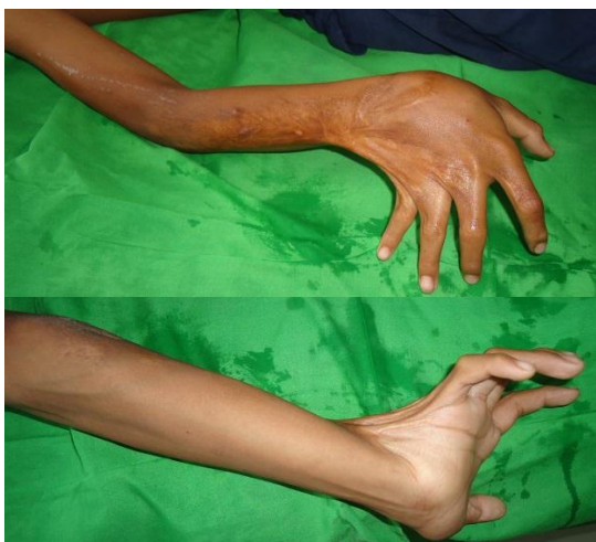
Burn Contracture right wrist before and after surgery