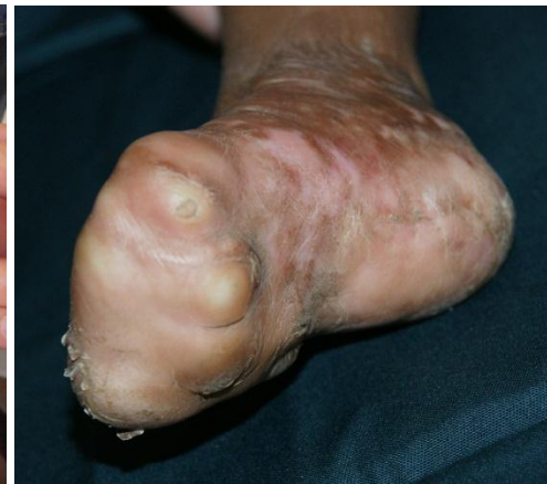
Burn with Toe flexion Contracture