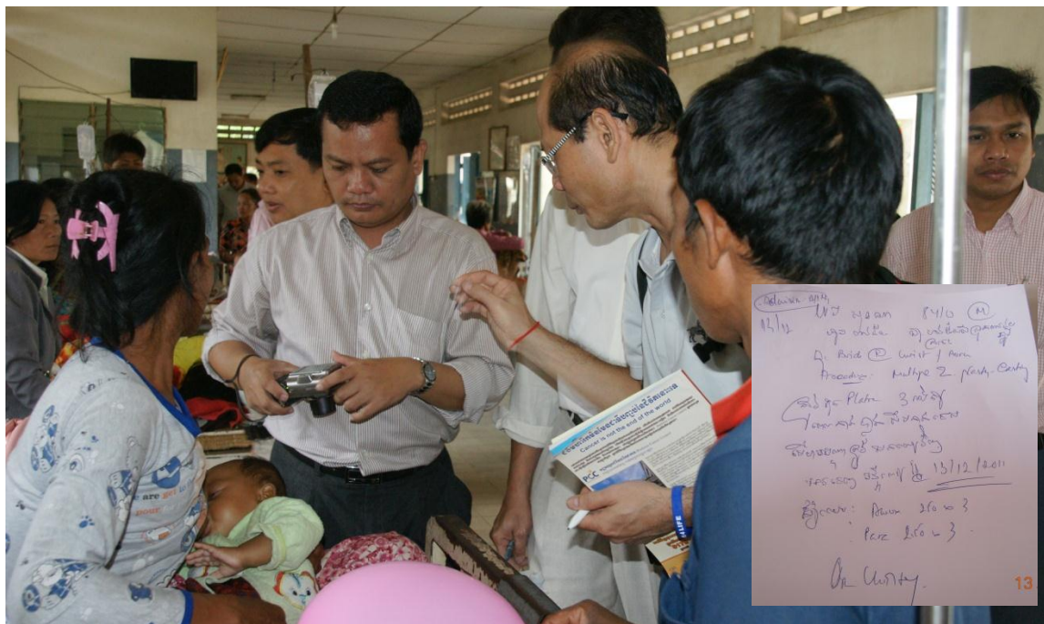
Recording Surgical Procedure, Recommendation – After Surgery