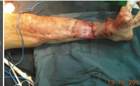
Very Severe Burn Ankle flexion Contracture Contracture of a 7 year-old girl, who got burn when she was 2 years old: Before and after Scar Contracture release-Skin Graft procedure.