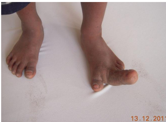
Congenital Acromegaly of 2 nd toe-left