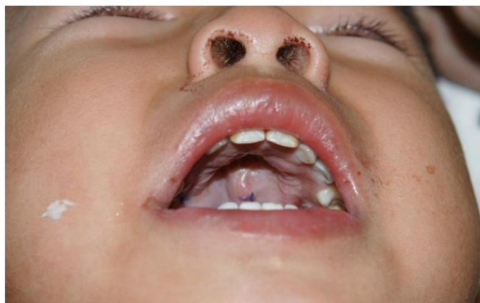
Palatoplasty of 15 month-old bot