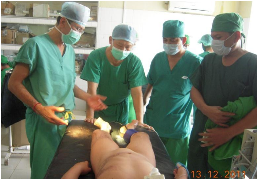
Bed Side Surgical Case Discussion – Prior to Surgery