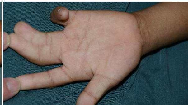
Syndactyly 3 rd -4 th finger