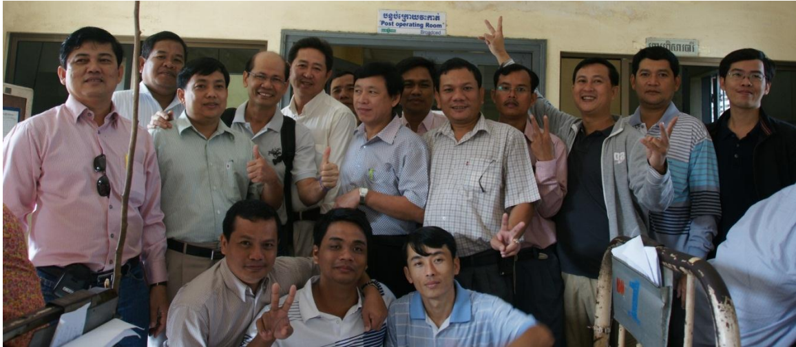
Surgical Team in the patient room, after Ward Round