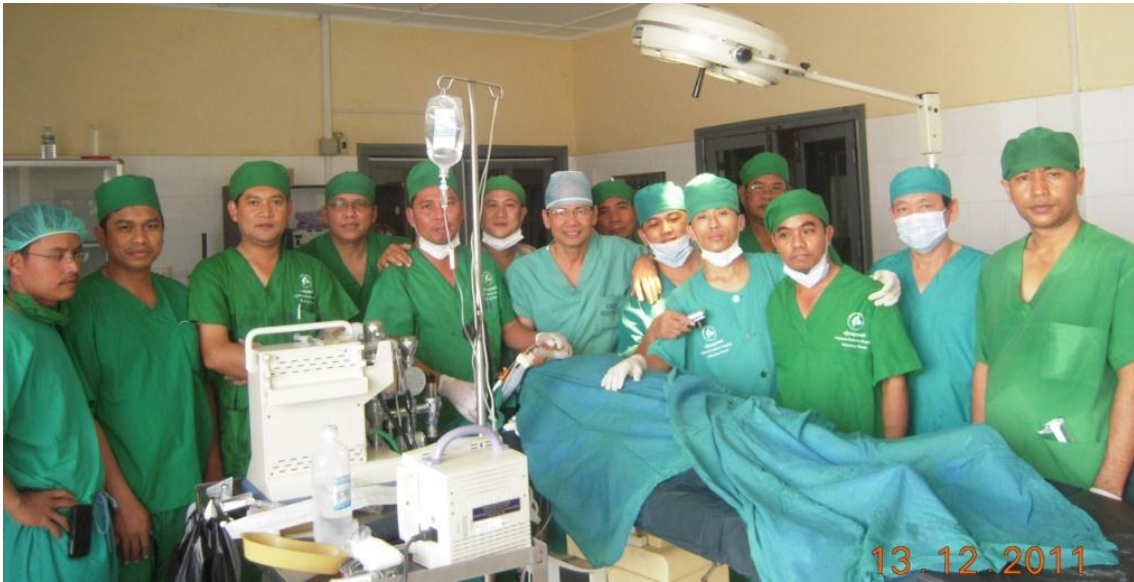
The 49 th Surgical Procedure: Last Case of the Mission: We Are Done !!!