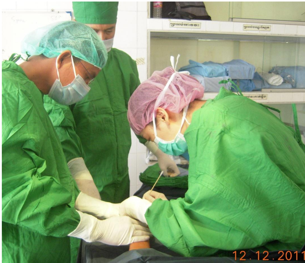
Reconstructive Surgery for Finger Burn Scar Contracture