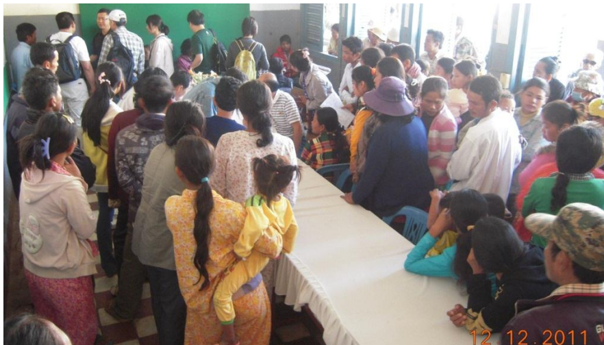
Patients-Families, Waiting for Registration and Consultation