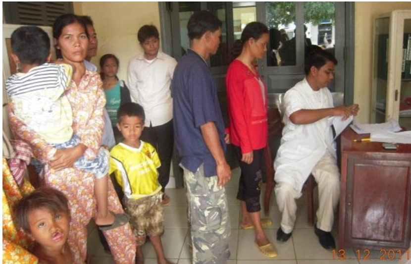
Preoperative Nursing and Patient record