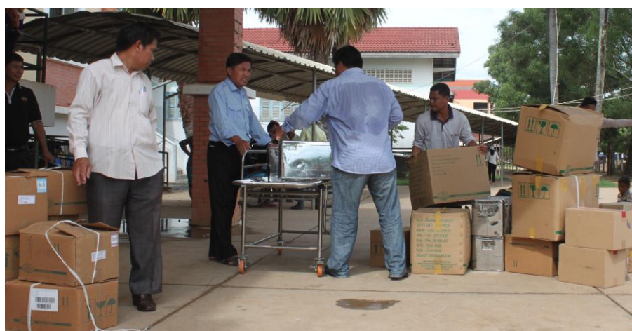
NPH surgical Team on its arrival at Stung Treng Provincial Hospital