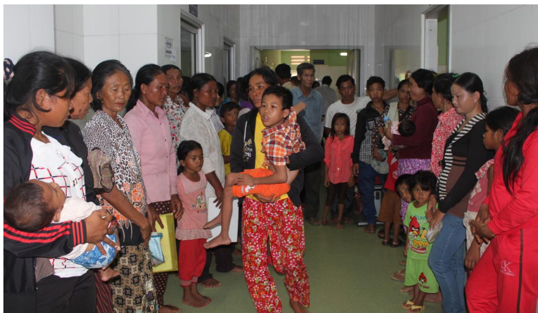
Waiting for consultation at mission site