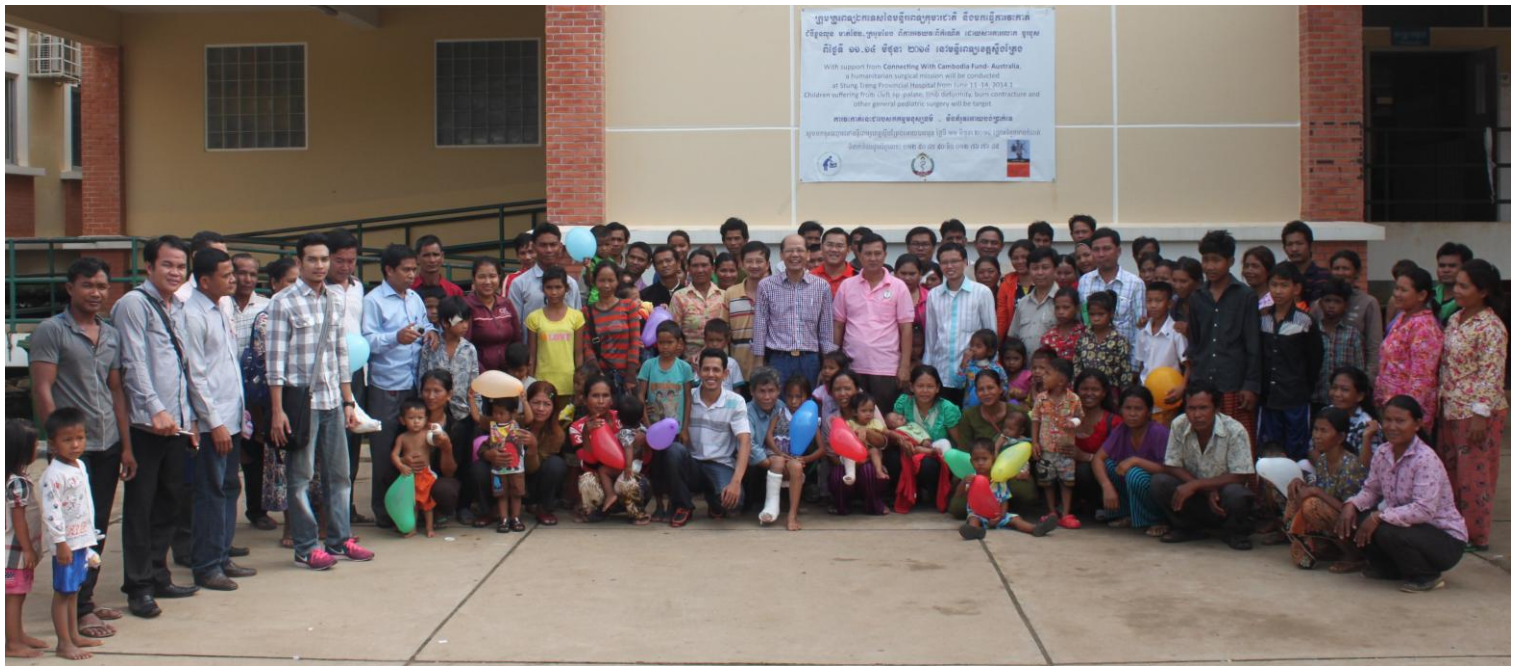
Missionary Surgical Team

Parents and patients who benefited from the surgical mission would like to express their great thanks to the Connecting with Cambodia Project from Australia (Rotary Australia World Community Services and Rotary Clubs of Balmoral-Brisbane/Phnom Penh) for its invaluable support to make this surgical mission happened.