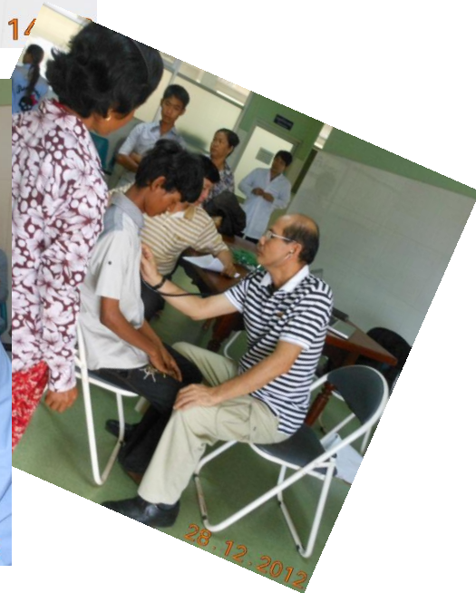
Patient consultation: 28 December 2012