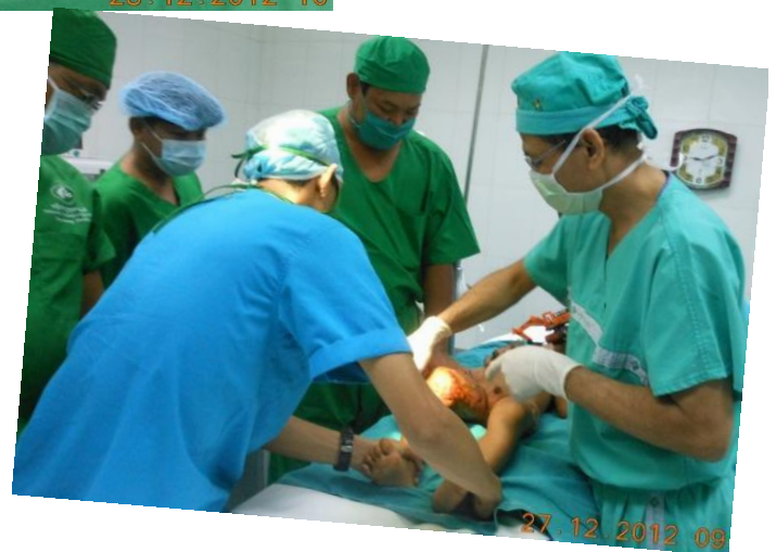
Varieties of surgical procedures conducting during surgical mission