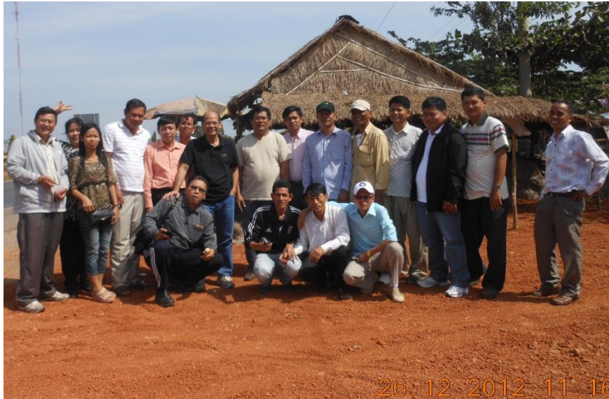
NPH surgical Team on its mission to Kampot Province, Midway stopping by along Highway Rd.No 3