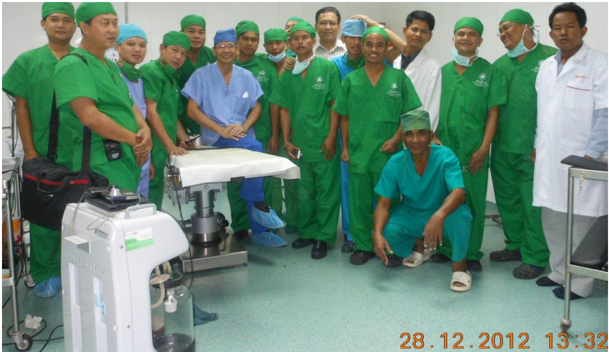
Missionary Surgical Team