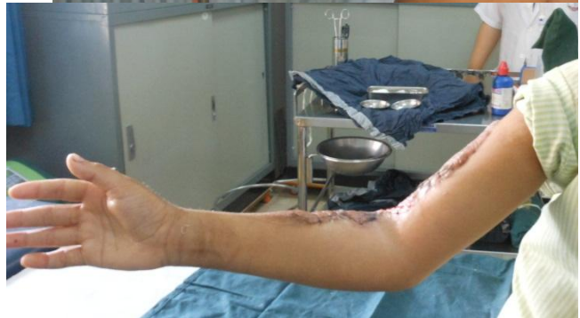
This 12 year-old boy who got burn when he was 5 years old, got his burn scar contracture released