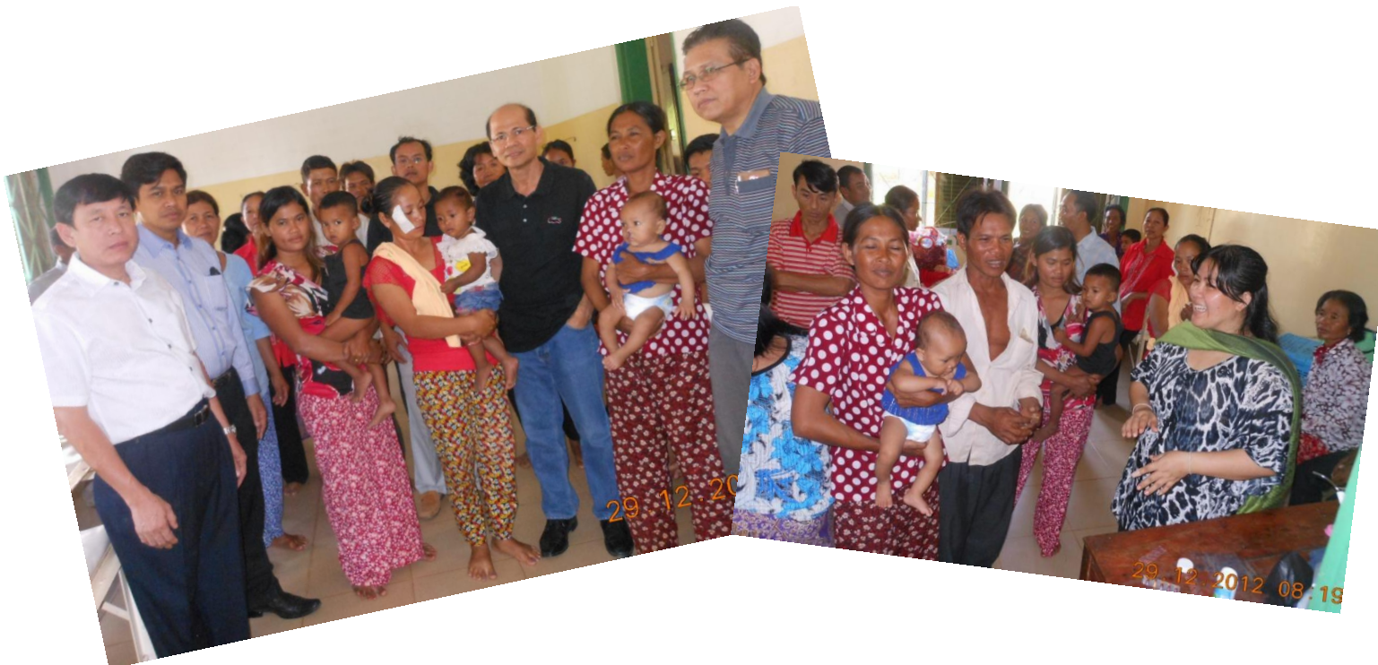
Ward round and group photos with operated patients and Parents on the last day of the mission