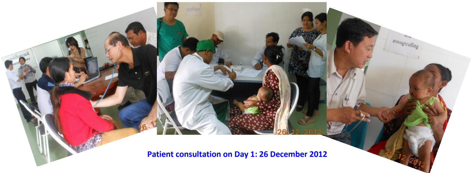
Patient consultation on Day 1: 26 December 2012